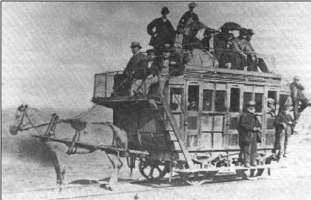
A carriage on the Oystermouth Railway, 1860s