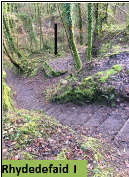
Capped Rhydydefaid I shaft