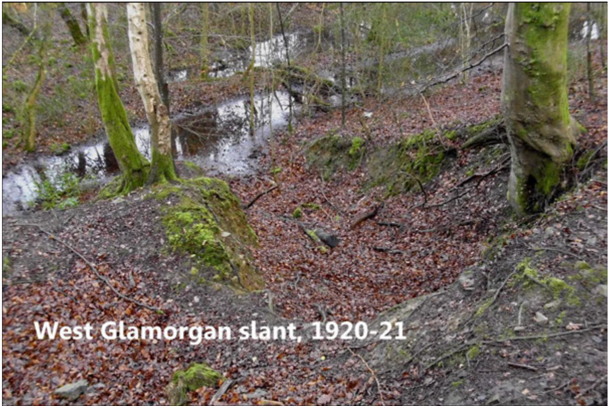
West Glamorgan slant, 1920-21