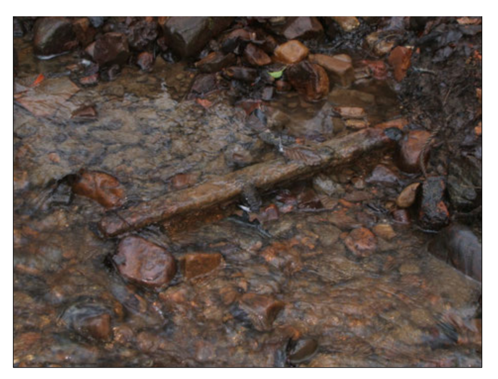
Surviving rail embedded in the side of a drainage ditch on the north side of the bridleway where it is crossed by the railway.